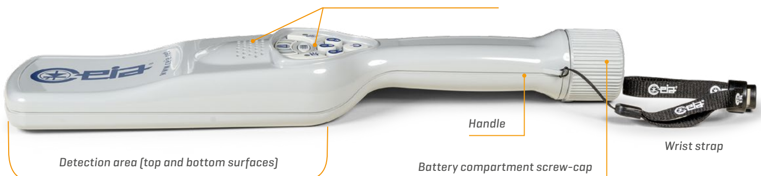
Detection area [top and bottom surfaces]